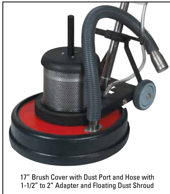
17" Brush Cover with Dust Port and Hose with 1-1/2" to 2" Adapter and Floating Dust Shroud