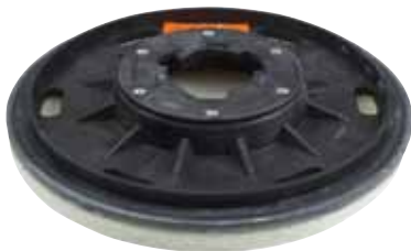
Deluxe Pad Driver with 17" White Pad

Converting between 15" and 17" is fast and easy.