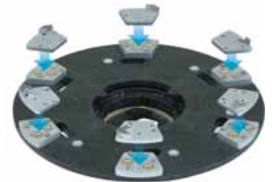
Single Arrow Diamond Trapezoids with Magnetic Quick Change Grinding Attachment