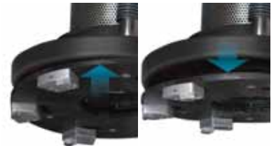
Quick Change Flex Plate provides more consistent pressure to deliver superior results.