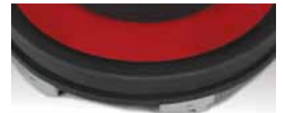
Grinds right up against walls