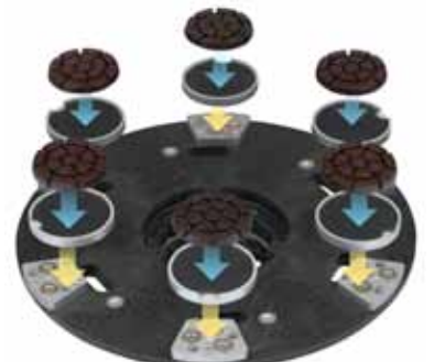
Super Pucks with Magnetic Quick Change Grinding Attachment